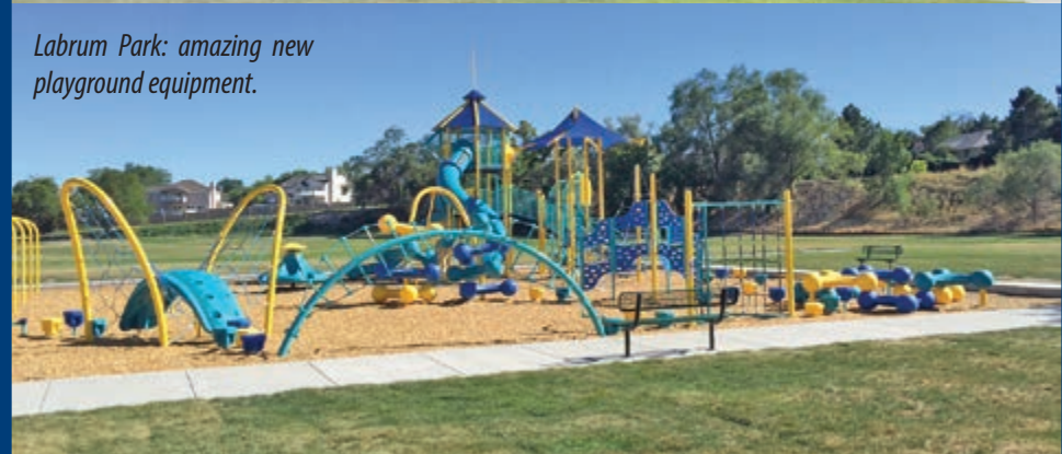
Labrum Park: amazing new playground equipment.