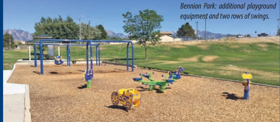
Bennion Park: additional playground equipment and two rows of swings.