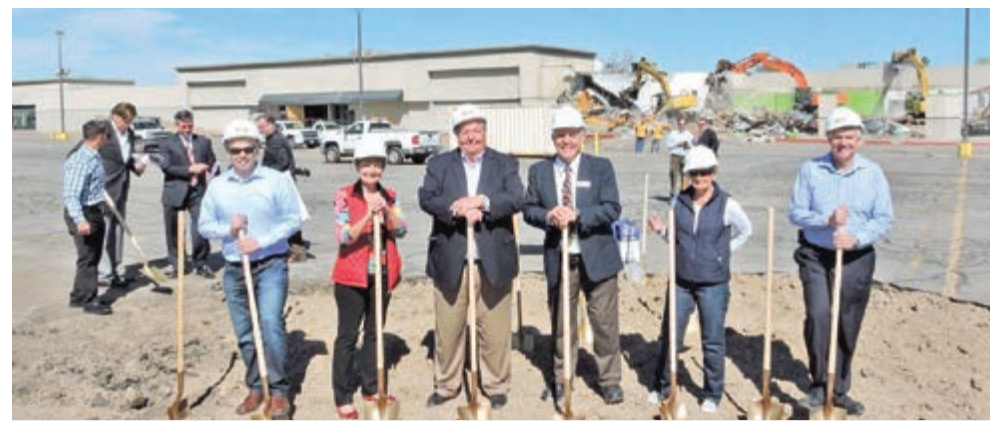
Demolition and groundbreaking at Plaza 5400.

Changes like this happen due to the dedicated efforts of elected officials and city employees. One of the most impactful events in retail recruiting is the annual ICSC Convention in Las Vegas