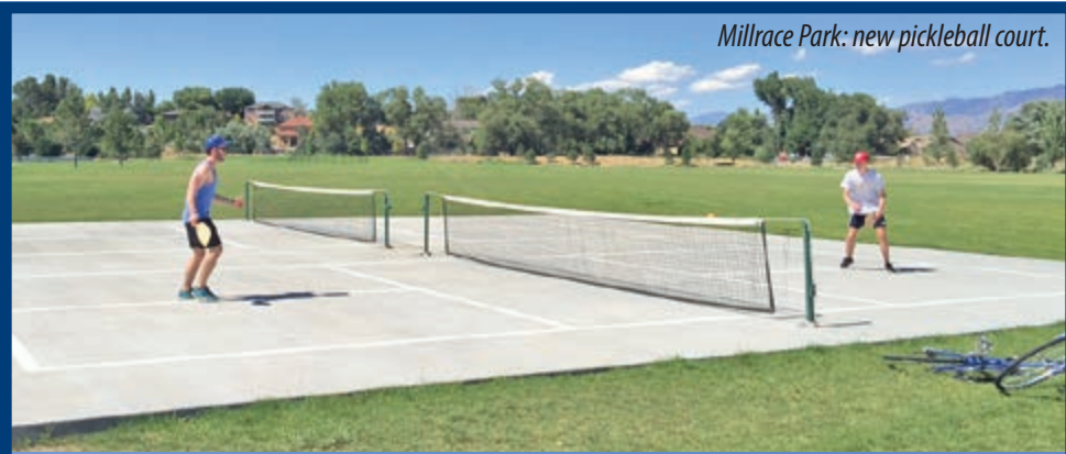
Millrace Park: new pickleball court.