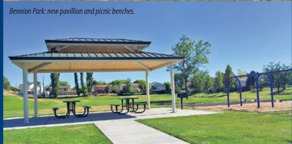
Bennion Park: new pavillion and picnic benches.